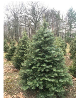
Sierra White Fir