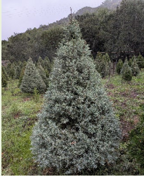
Monterey cypress (blue) Seedlings are available through the CCTA.