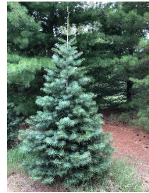
"Apache" Concolor Fir