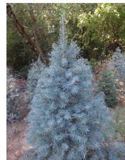
"Swift's Silver" White Fir